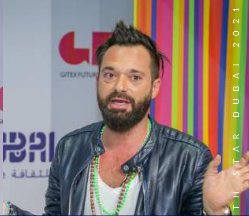
SACHA JAFRI Contemporary Artist & 'The Pioneer of Magical Realism'