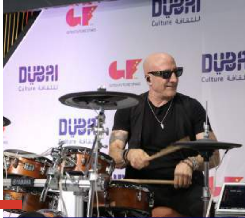
KENNY ARONOFF Among Rolling Stone's 100 Most Influential Drummers (USA)