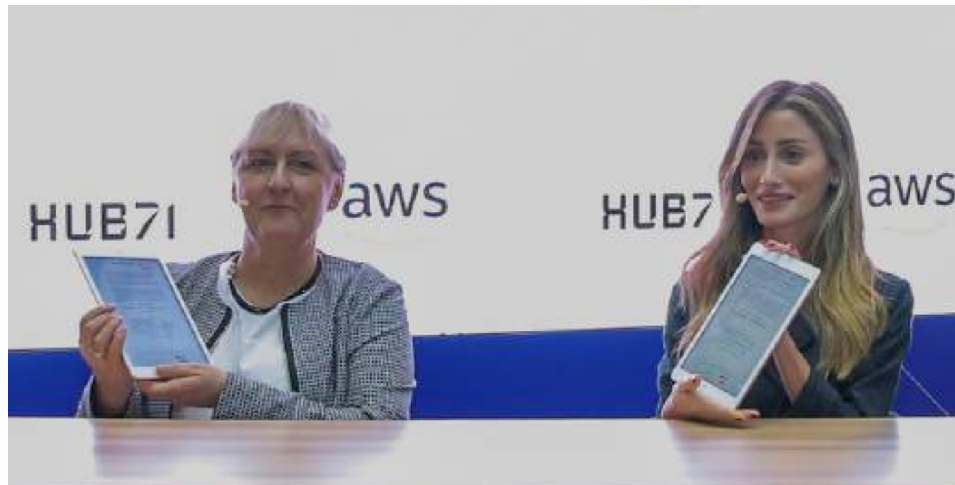
Hub71 signed an MoU with Amazon Web Services to accelerate startup growth in the cloud