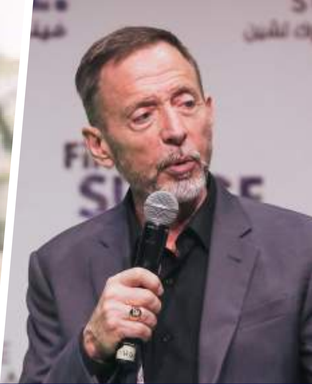
Chris Voss CEO & Author Black Swan Group