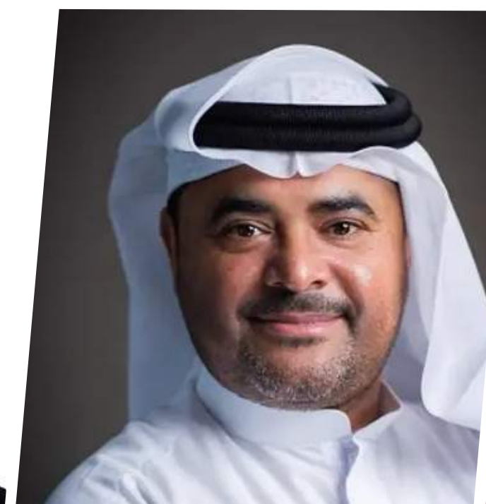
MOHAMMED SHAEAL ALSAADI CEO of Corporate Strategic Affairs Dubai Economy UAE