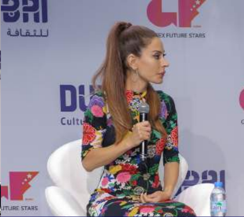
KERRI KASEM Media Personality, UFC Host, Founder KasemCares USA