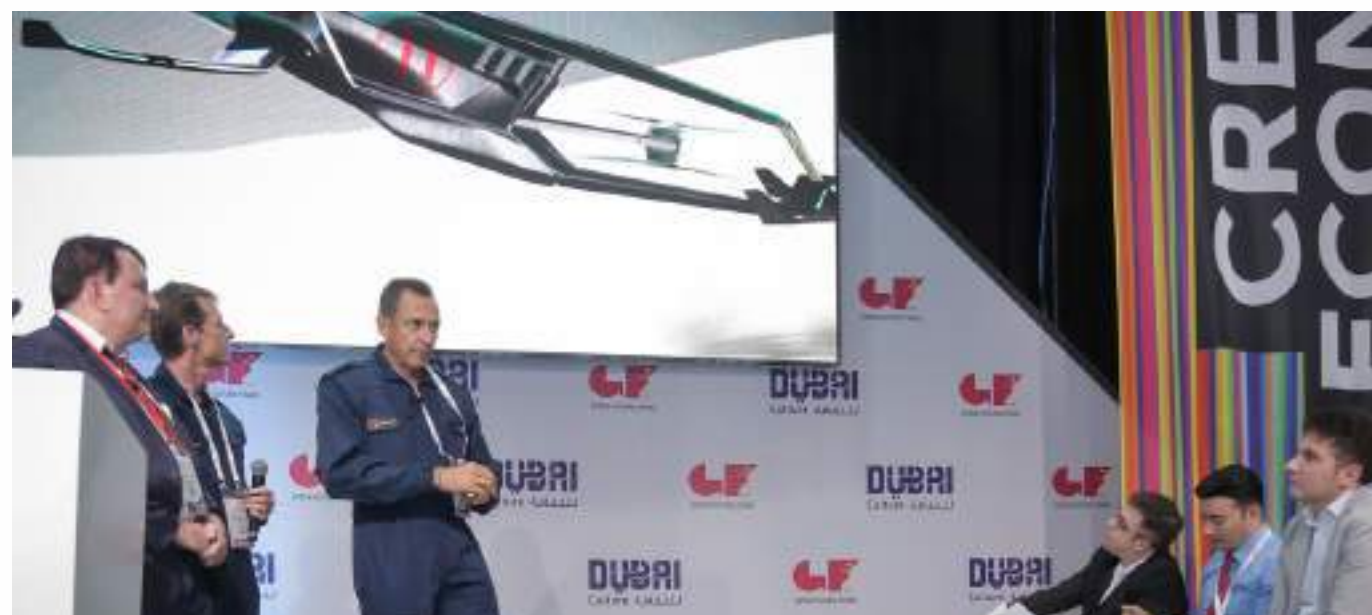
Maca, world's first hydrogen powered CarCopter