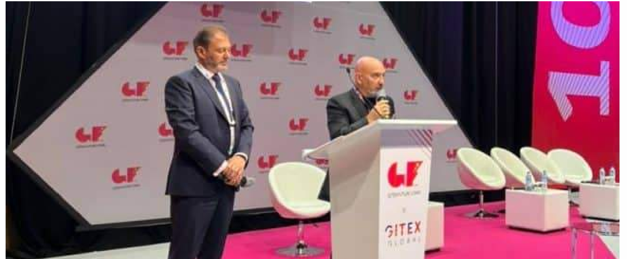
GELLIFY & AZIMUT group signing of their USD 50 million middle east venture fund launch