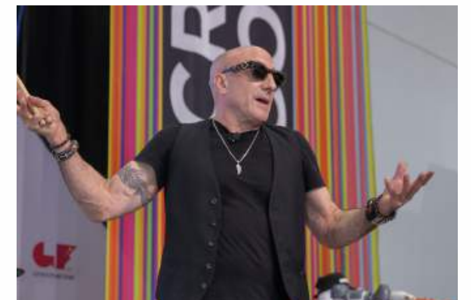
Legendary Jon Bon Jovi Drummer Kenny Aronoff performs live at the show